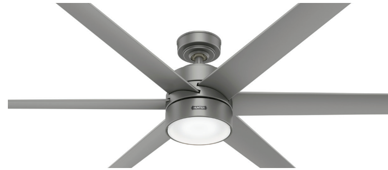
59629 Matte Silver Body with Matte Silver blades