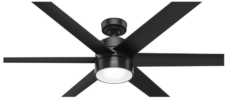
59628 Matte Black Body with Matte Black blades