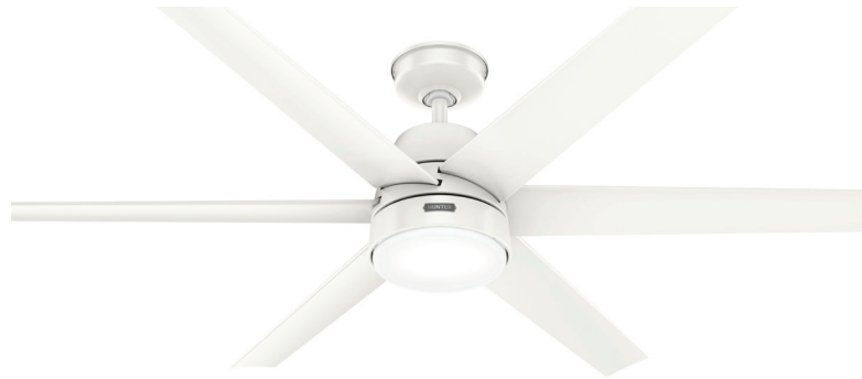
52370 Fresh White Body with Fresh White Blades