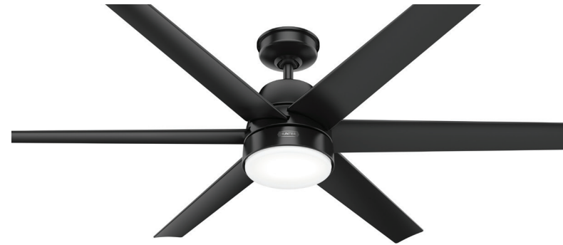
51875 Matte Black Body with Matte Black blades