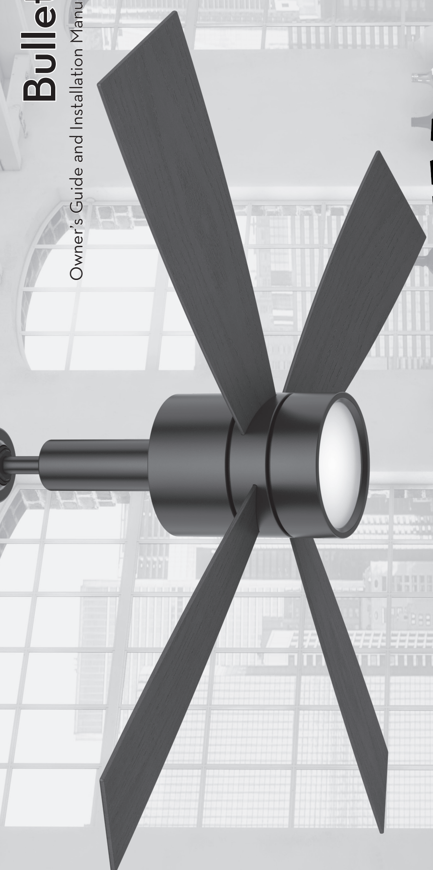
Owner's Guide and Installation Manual