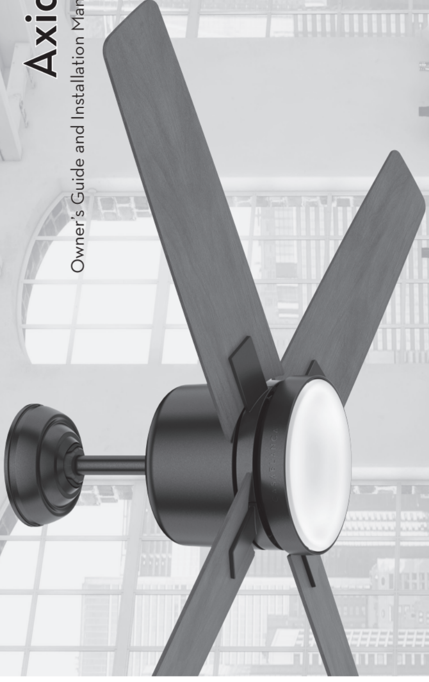
Owner's Guide and Installation Manual

Models 51739: Fresh White 59341: Noble Bronze 59342: Matte Nickel Weight ±2 lbs: 21.2 lbs (9.6 kg)